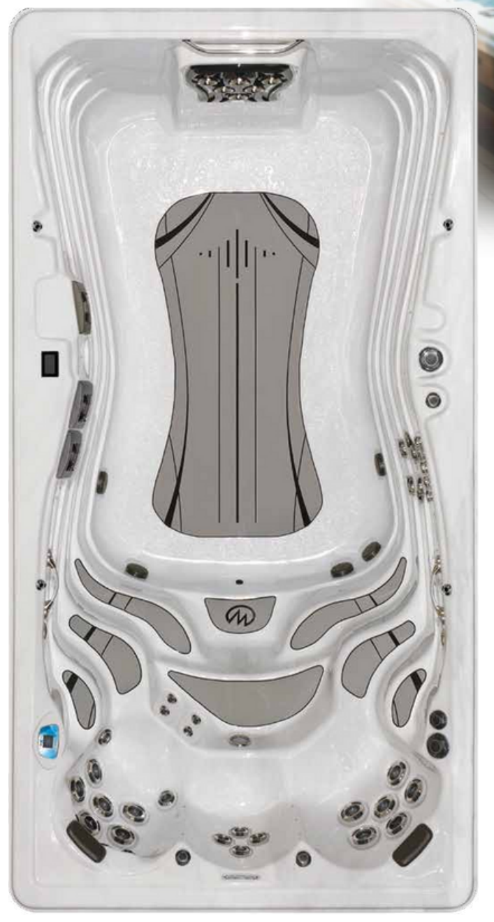
Shown with optional Nonslip, Comfort Floor System

Elite Performance, Airless VIP, Programmable Speed